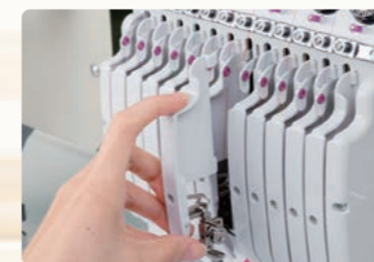
● Middle Thread Guide for easy threading