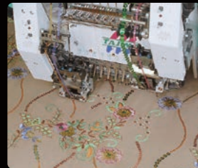
Sequin Device III [Twin Type] <PAT> Embroidering 2 different sequins by freely switching them at high speed