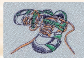
Embroidery with the extra-fine thread (Actual dimensions)