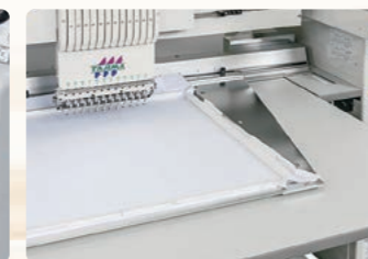
● Reinforced Border Frame