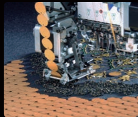
Sequin Device IV Embroidering various sequins: small-diameter sequins, large-diameter sequins, irregular-shaped sequins and eccentric sequins