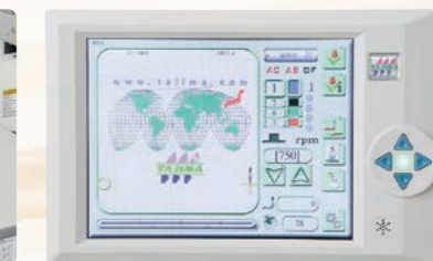
● Touch Screen Operation Panel