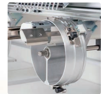
Reinforced Wide Cap Frame