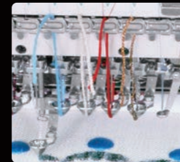
Multi cording Device Embroidering 6 various types/colors of cords